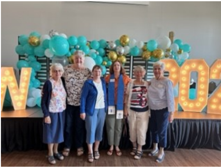
HAD A BLAST AT Spring Gathering at Nor'kirk in May!